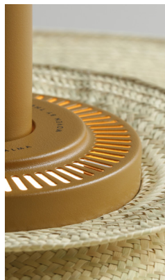
Palma beige ochre (PA001C-oc)