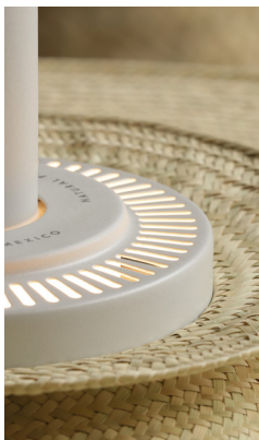
Palma beige warm grey (PA001C-bl)

Variations in colour, texture, shape & size are natural characteristics of handmade products and should be expected.