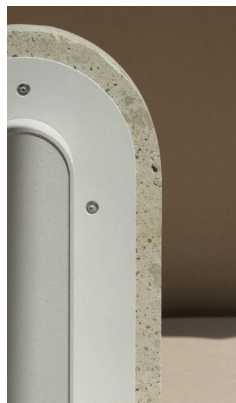
Ambra Toba table white PV013T-bl