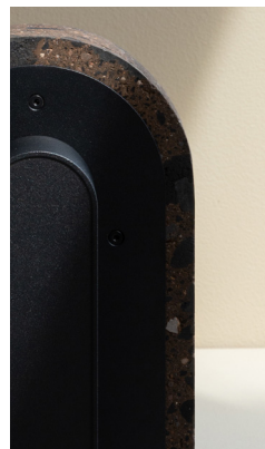
Ambra Toba table black PV013T-ne